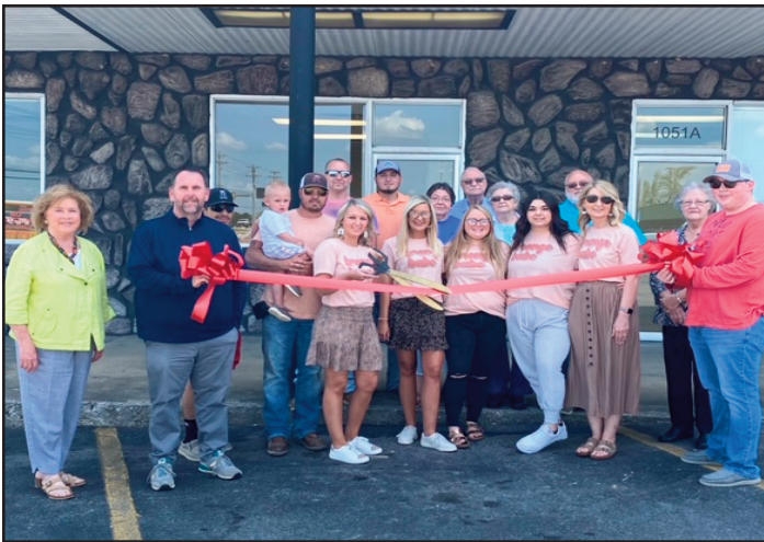
Bronze Babe Tanning Salon Ribbon Cutting Held April 22, 2022.