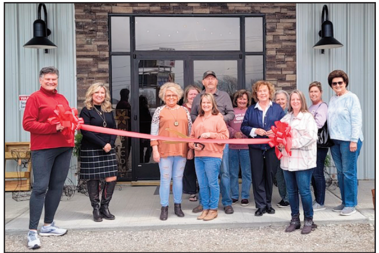
Sunshine Decor Grand Reopening and Ribbon Cutting held April 2, 2022.