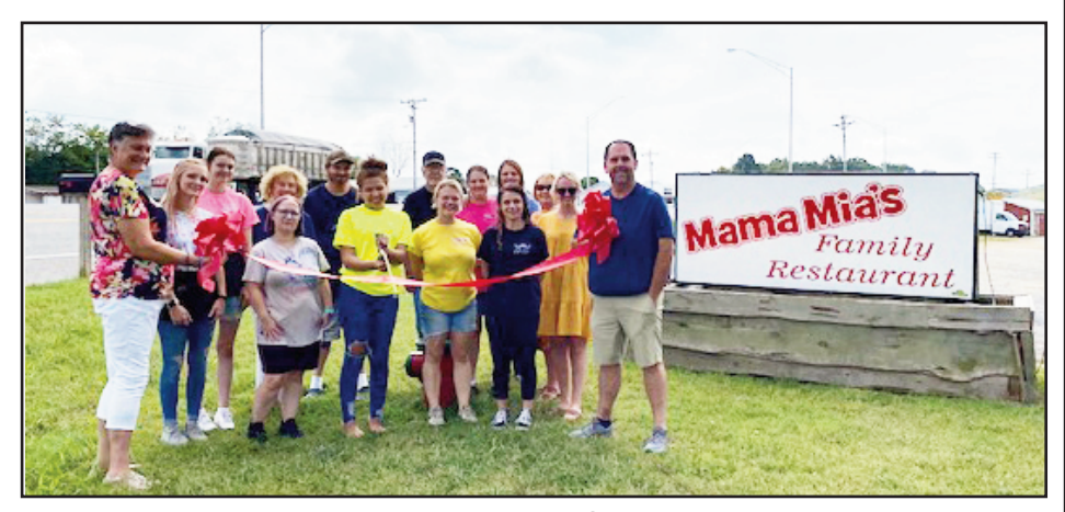
Mama Mia's Ribon Cutting Event

Red Boiling Springs Fire Dept and Rescue