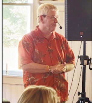
Chamber September Luncheon