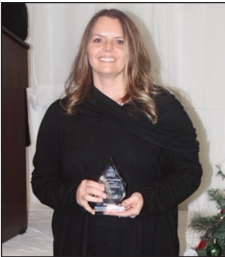
Individual/Organization of the Year - Waymakers Center.