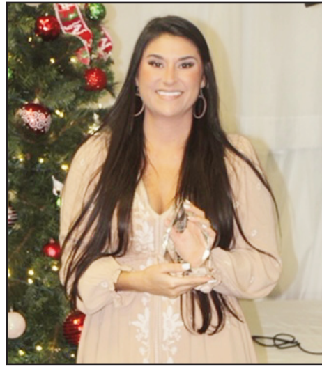
Large Business of the Year - Lafayette Hometown Foods.