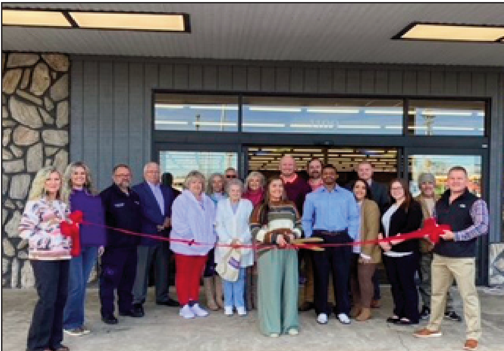
Ribbon Cutting Ceremony held December 1st for new Chamber member Farmers Home Furniture.