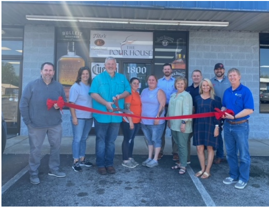
Pour House Wine & Spirits 4/10/22