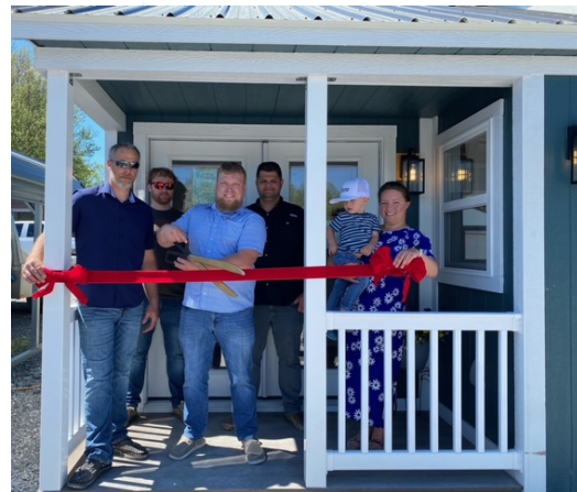
Aveanna Healthcare 4/20/23