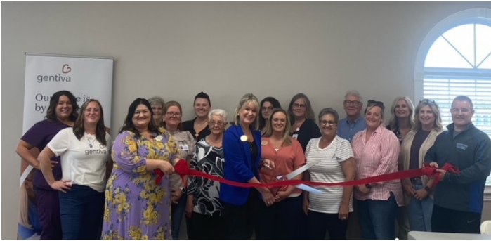
A ribbon cutting ceremony was held for Gentiva Hospice on May 5, 2023