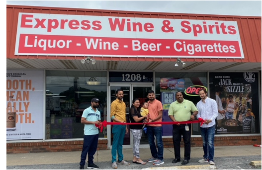
A ribbon cutting ceremony was held for Express Wine & Spirits on May 19, 2023.