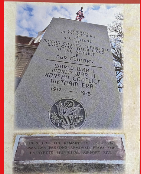
Macon County's Historic Cemeteries, Monuments & Markers